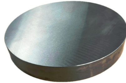
Obrys frezowany, grubość szlifowana Milled outline, ground thickness